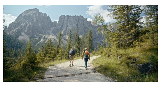
Day 3 – Sat, 13/09 SMACH 2025: Creativity in the Dolomites

Movie evening with the screening of the documentary film Elevated Art about the SMACH 2023 edition and Q&A with the film director .