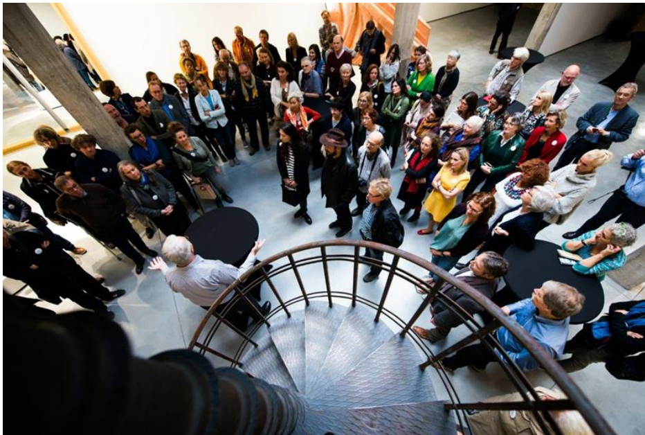
International Forum, Visit Van Haerents Art Collection, Brussels, BE

Sculpture Network promotes contemporary three-dimensional art in Europe by connecting artists, mediators, collectors and lovers of sculpture.