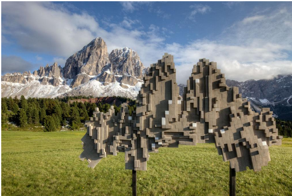
SMACH! sculpture trail Dolomites, Patricija Gilyte, Blindenschriftpanorama.