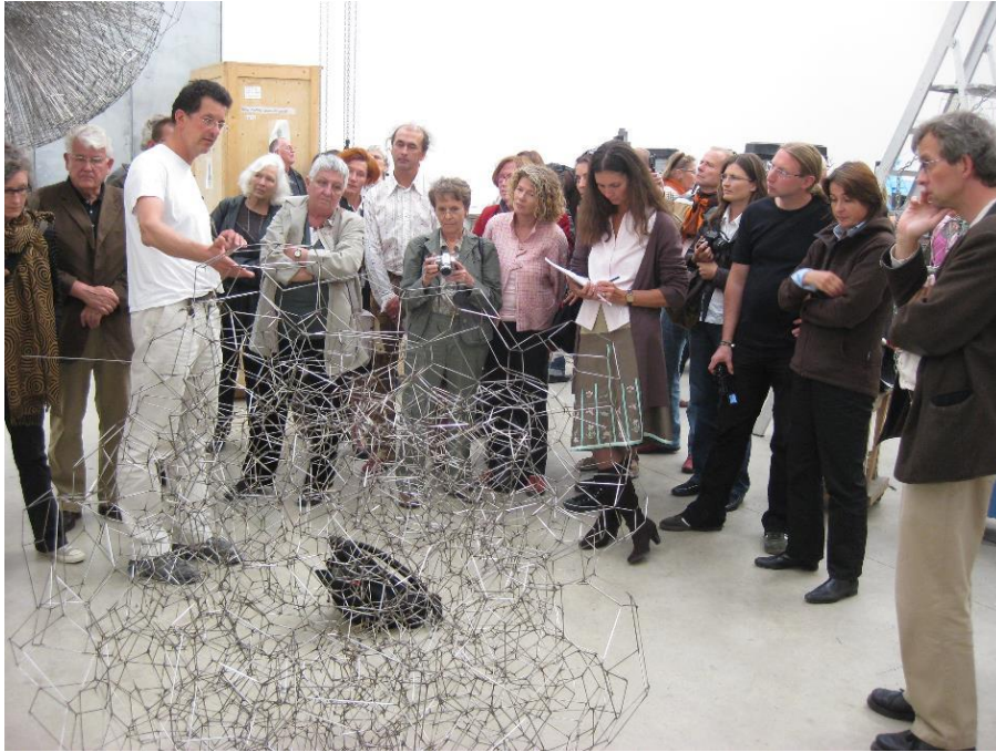
Studio visit Antony Gormley, London, UK