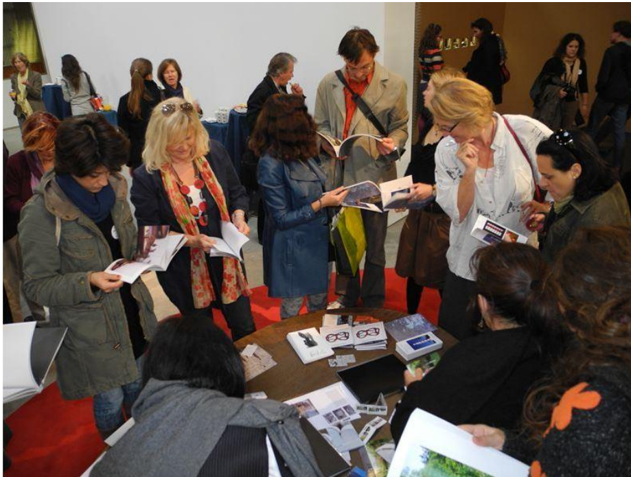
Showroom at International Forum, Bilbao, ES

At all these events, you can show your portfolio in the so called showroom.