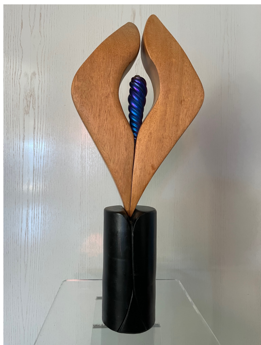
"Meditation" (teak, glass, marble)

Here some examples of her abstract work, inspired by her experience of Qi: