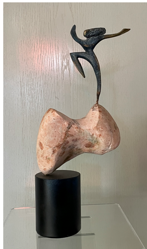
“Youth” (alabaster, bronze)