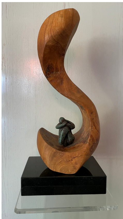
“Refuge” (Yew tree, Bronze)

Here some examples of sculptures (Bronzes based on carvings) from 1975 -2002)