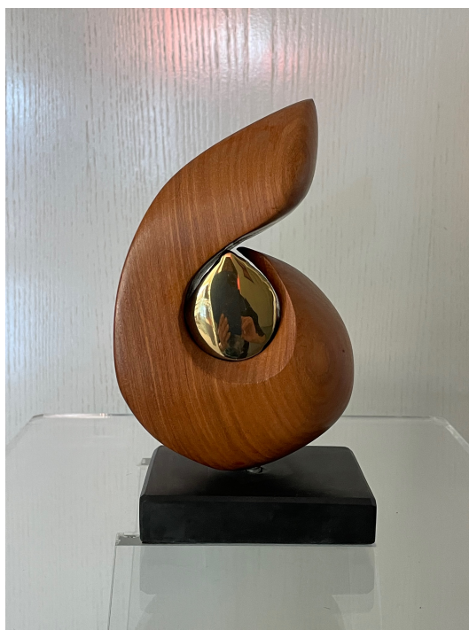
"Prana" (brasilian walnut, bronze)